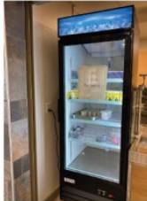
The new fridge gives children easy access to milk, salad dressings, yogurt, cottage cheese and other items during breakfast, lunch, and dinner.

Through this Mission Grant, the women of the Iowa East District provided for our children's most basic needs and ensured our Nutrition Center is an environment conducive to Christ-centered hope and healing.