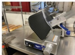
The food slicer is used to cut fresh meat, fruits, and vegetables.

Although the purchased equipment isn't used directly by the children, it's impact is still felt in how we care for them,