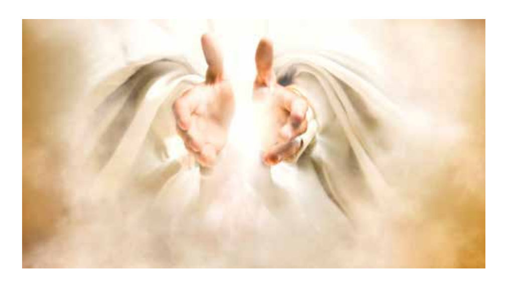
I have not come to call the righteous but sinners to repentance (Luke 5:32).