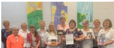
The Eventide group with the plaque from the college

One of the mission projects for the Eventide LWML at Trinity, Clinton is to sign Christmas cards to send to active-duty soldiers and veterans. Cards are signed with a brief message, your home location with your name being optional. The project also involves sending unsigned cards to the troops for their use. Cards are then taken to Clinton Community College where the Phi Theta Kappa honor society forwards them to the military. We enlisted the help of the congregation in signing the cards. In 2020, we were able to send 650 signed and 330 unsigned cards to the troops. As a result of the success of last year's project Eventide was named the Alumni Association Outstanding Friend of the College for 2021 . It was a wonderful way for our group to connect with the college and provide a service to our military personnel. As an extension of the card signing project, Eventide decided to send a Christmas card to every nursing home patient in Clinton. Again with the help of the congregation we were able to take around 500 cards to the nursing homes. We received several positive comments from the residents.