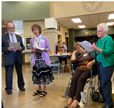
The Christian Life committee performed, "In His Hands," from the LWML website at the Cedar Rapids Zone Event.