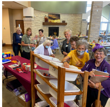
Women assembling blessing bags filled with school supplies at the Cedar Rapids Zone Event hosted at King of Kings in Cedar Rapids.