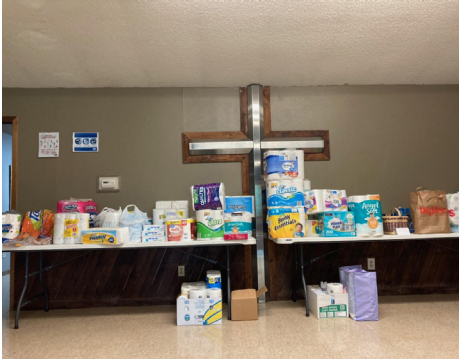
Ingathering for Camp lo-Dis-E-Ca