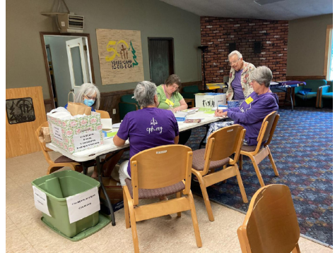
Signing cards for soldiers as a servant event. This is a joint project with Trinity Lutheran in Clinton and Clinton Community College.