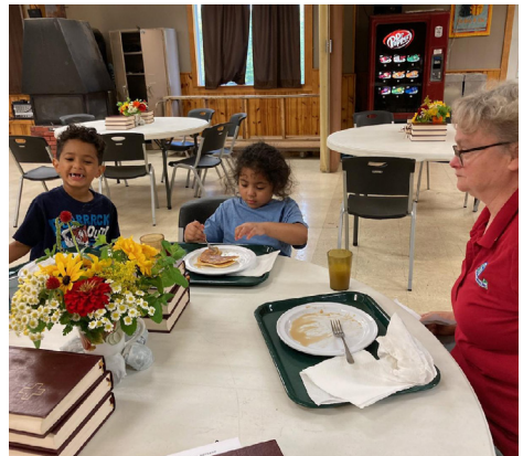
Grandkids eating with Grandma. There was programming for everyone and family time too!