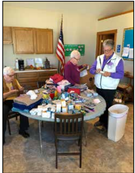
Assembling 51 health kits for Lutheran World Relief at the Williamsburg Zone Fall Gathering.