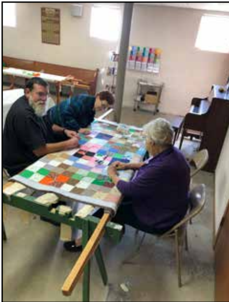
Tying a quilt for Lutheran World Relief at the Williamsburg Zone Fall Gathering.