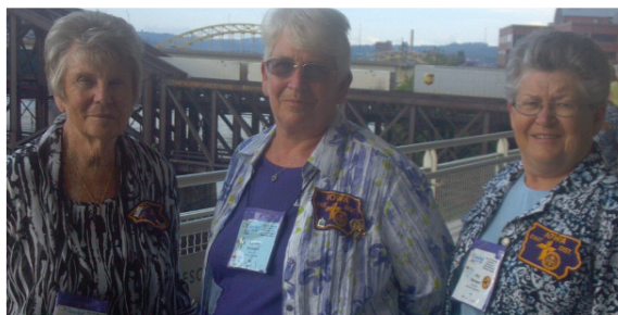
Iowa East members at riverfront