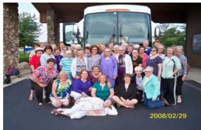
The Iowa East bus riders!