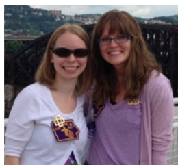
YWRs get a view of the river