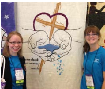
YWRs posing with Iowa East banner