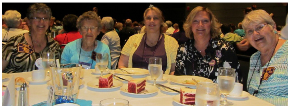
IED members enjoy dinner at Convention