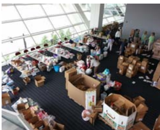
Almost 22,000 items were turned in for Gifts From the Heart.