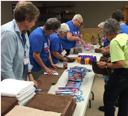
Assembling Blessing Bags