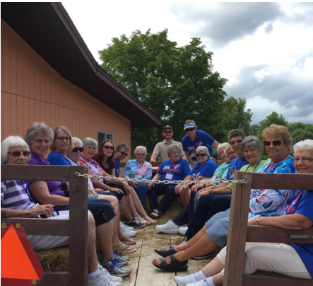
Hayride before the rainfall