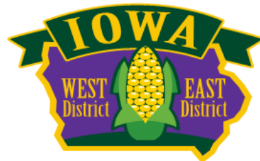
Iowa East & West convention badge

Please keep all members of the Host Committee in your prayers, as we make worker assignments and finalize convention plans. May all our efforts result in a convention that glorifies God, and focuses on the mission of the LWML, bringing Christ's love and His message of salvation to all.