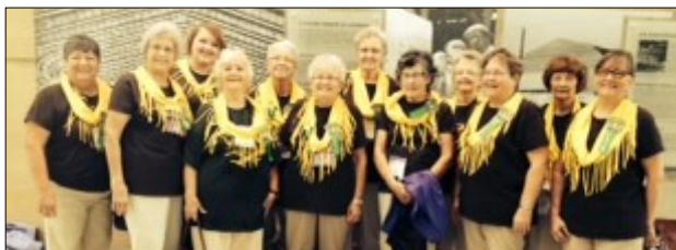
Women from the Council Bluffs Zone are ready to work as volunteers.