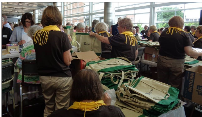
The registration area was busy as more than 4,000 guests arrived.