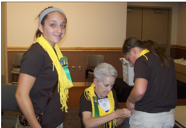
Volunteer workers make sure they are ready to help in many areas of Convention.