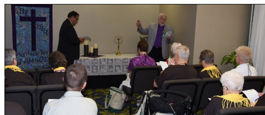
Grace Place Chapel dedication.

Our banner verse, Be still and know that I am God (Psalm 46:10a NIV) continues to serve as a reminder that being still and taking time to pray may just be part of the equation. Being still and looking (or listening) for the answers to those prayers might be part of it, too!