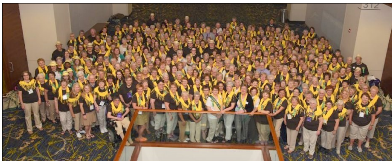
Host Committee members and Iowa East and West volunteers gathered together on Sunday morning. More than 700 workers helped make the convention run smoothly.

The final count of all workers scheduled (including host committee, directors, and other volunteers) from the master schedule was 734. The counts of workers by day were: Wednesday - 217; Thursday - 492; Friday and Saturday - 332 each day; Sunday - 84. There were also 278 different shifts among the five days.