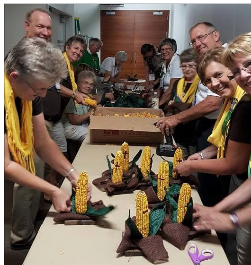
The Creative Enhancements Committee recruits volunteers to put final touches on the table decorations.