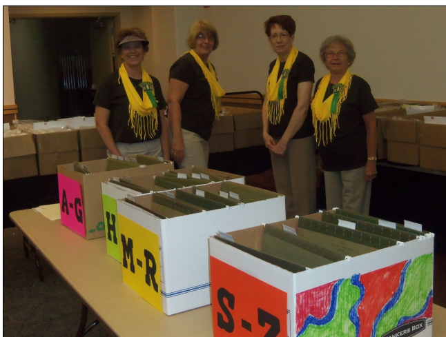
The Personnel Resources Department is ready for volunteers to pick up their worker shirts and badges.