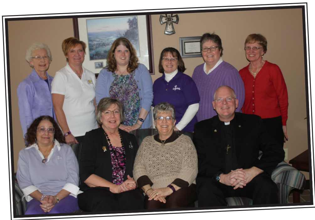
Pictured: LWML TED Executive Board