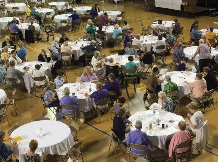
Delegate orientation explained to delegates how the voting process should work.