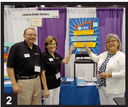
2- One Mission Grant Iowa East District is funding is Lutheran Bible Translators for Braille Bibles for inmates. The staff is pointing to what districts funded them.