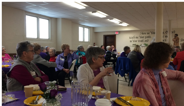
Ladies gathered for the Rally

The ladies of Trinity Lutheran in Cedar Rapids are celebrating 100 years as a society! Thank you ladies of Trinity Lutheran for hosting the Cedar Rapids Zone Spring Rally.