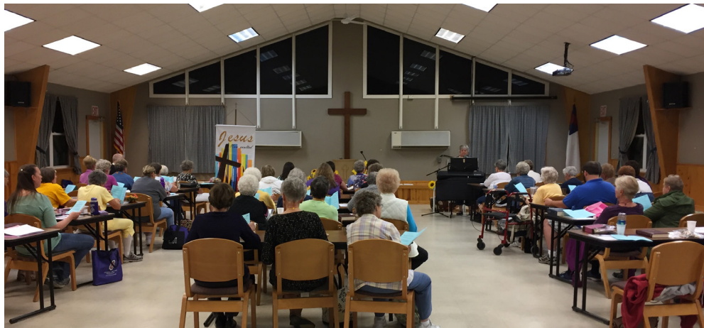
LWML women at Fall Retreat celebrate Jesus Christ as Lord.

For to us a child is born, to us a son is given; and the government shall be upon his shoulder, and his name shall be called Wonderful Counselor, Mighty God, Everlasting Father, Prince of Peace. Isaiah 9:6.